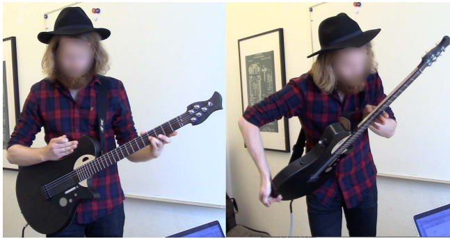
Figure 3. Exploring the Front-Back Movement