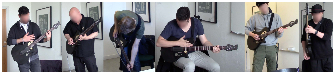
Figure 2. The Sensus Guitar in Action